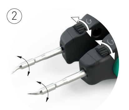
Rotational alignment Rotate the cartridges in any direction through the wheels ensuring the cartridges are on the right position.