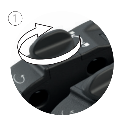
Locking Manual fixing and releasing without any tool.